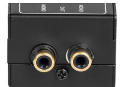
CH1 CH2 Outputs