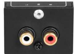
Left Right Inputs