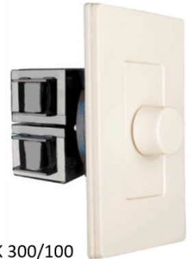
SLK 300/100 Screwless Face Plate

The SVC300/100/50 plus the SLK300/100 feature an Impedance Switch located under the Decora Insert Plate on the left side. Note the 2X, 4X and 8X represents the number of 8-ohm speakers connected in Parallel. All Volume Controls connected to a single amp in parallel will be set to the same number. The following charts are used to calculate the Impedance setting, one is based upon using an 8-ohm Amp versus a 4-ohm Amp.