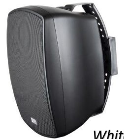
White or Black